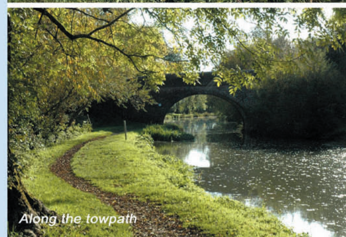
Along the towpath