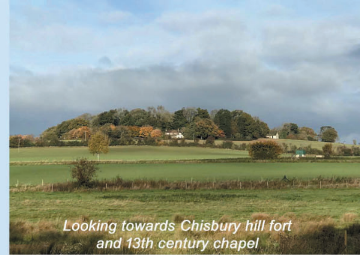
Looking towards Chisbury hill fort and 13th century chapel