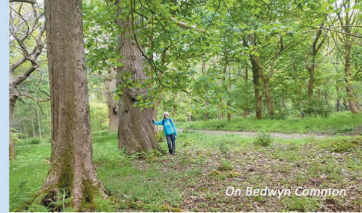
On Bedwyn Common