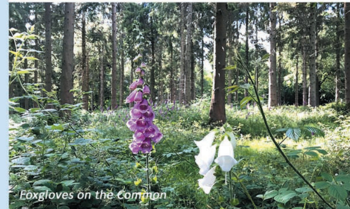
Foxgloves on the Common