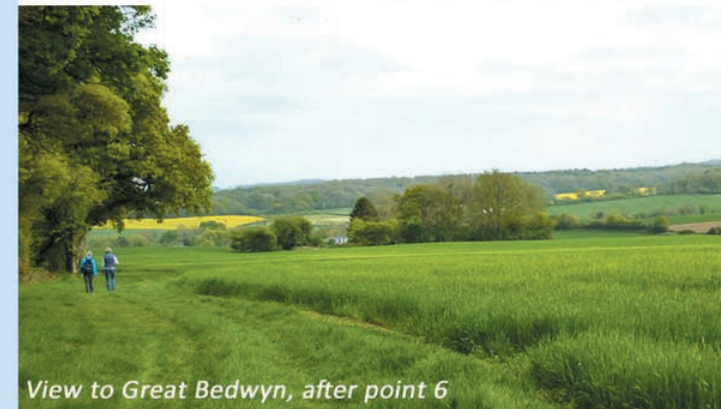
View to Great Bedwyn, after point 6

* For a longer route (extra 800m, ½ mile), or to avoid livestock which sometimes use this field, turn right here and continue along the track taking the signed bridleway entrance by the cottage at the bottom. Carry on along this tree-lined track until you reach a road. Turning left takes you back into the village; or go straight on to reach the canal and return along the towpath.