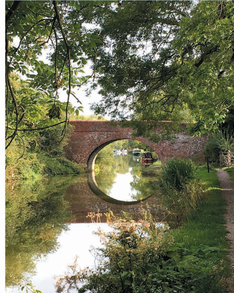
Distance: approx 6.5 km (4 miles) Map: OS Explorer 157

This walk starts from the village square, goes out of the village along Galley Lane, crosses fields skirting the Brails and down to the canal towpath. Leaving the canal and railway behind, it goes up Hatchet Lane to cross the fields towards Chisbury Wood, where it drops back down into the village.