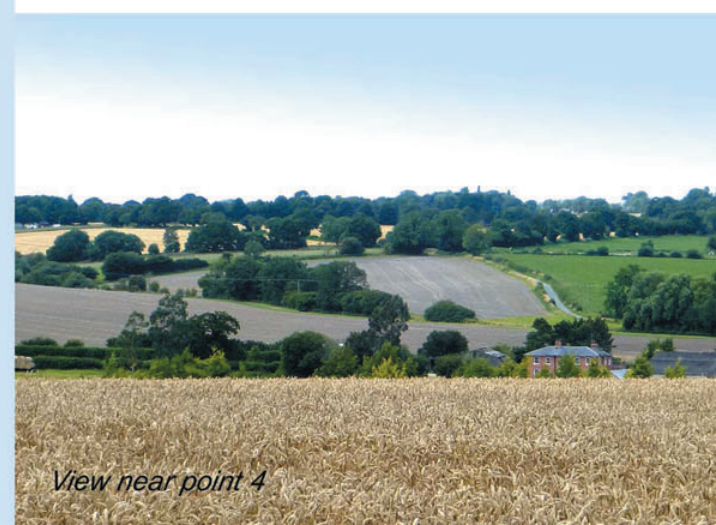
View near point 4